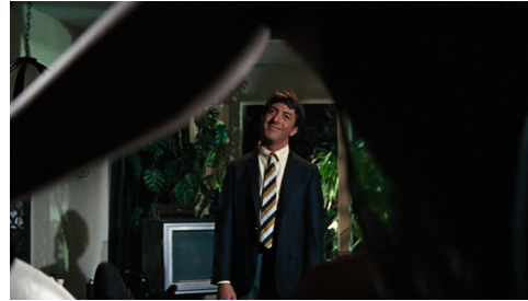
Still image from The Graduate dir. by Mike Nichols

S: That's true. During this whole conversation the one image in my head is the famous frame from The Graduate . With the triangle of legs which frame him in full figure. That is stuck in my head as a still image and there is no movement. Actually in the scene there is not a lot of movement. He just stands there and...has this awkward smile on.